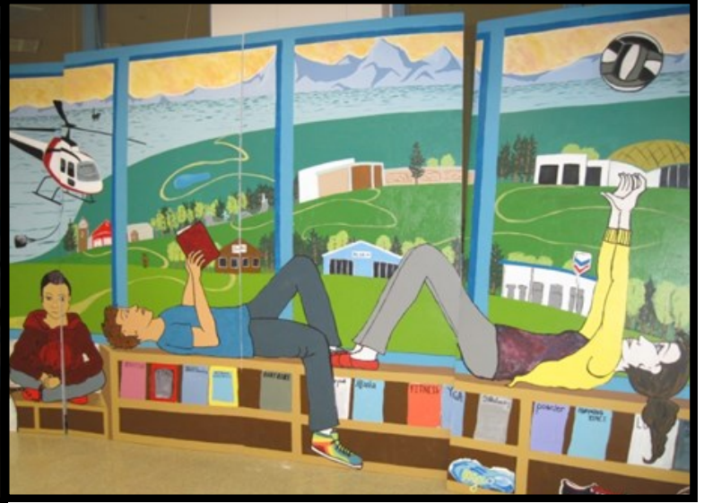
Half of the finished school mural "Tides and Ties"